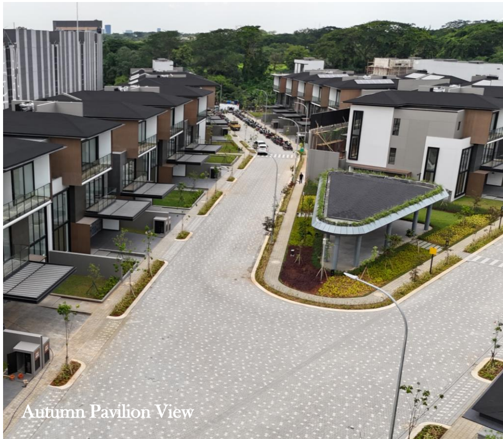
Autumn Pavilion View